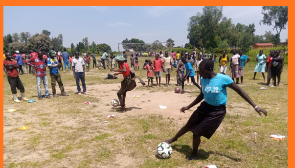
Adolescent girls taking part in a grassroots soccer session in Maracha District.

We also continued work on adolescent sexual and reproductive health through life skills using the Grassroot Soccer Curriculum.