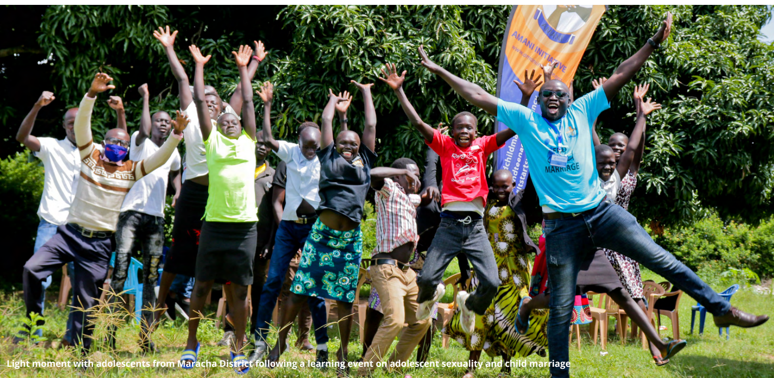
Light moment with adolescents from Maracha District following a learning event on adolescent sexuality and child marriage

We also onboarded 12 new partners who included Save the Maracha Girl, West Nile Youth Empowerment Centre, Joy for Children, Ensibuuko, Taproot Foundation, Grassroots Soccer, Edify, Rego Foundation, UN Women/WPHF, Maracha District Women Caucus, Christian School Owner's Association and King Baudouin Foundation.