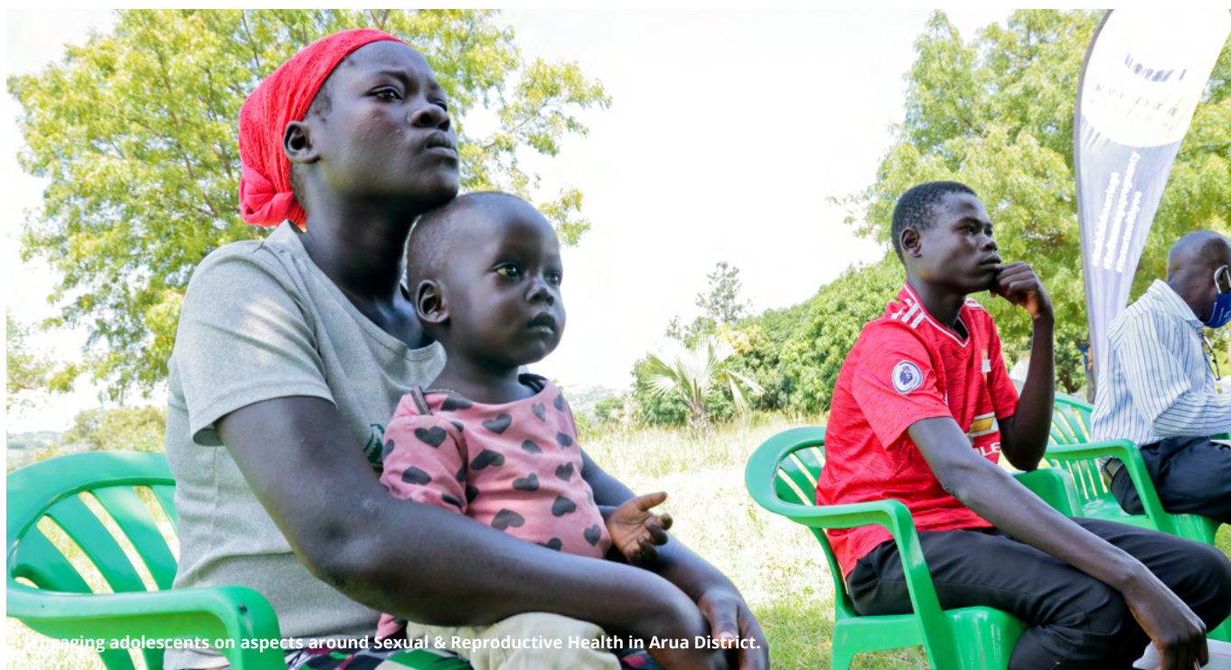
Engaging adolescents on aspects around Sexual & Reproductive Health in Arua District.

Lack of access to age-appropriate sexual and reproductive health information and services increases the risk of adolescent boys and girls contracting sexually transmitted diseases or becoming pregnant which is a key strategic thematic focus area for Amani Initiative. Through Grassroots Soccer, Community Skyrocket, and Amplified Community Action we have been able to make this possible for 1,638 youths within 2020.