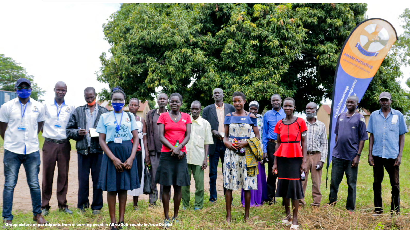
Group picture of participants from a learning event in Aii vu Sub-county in Arua District