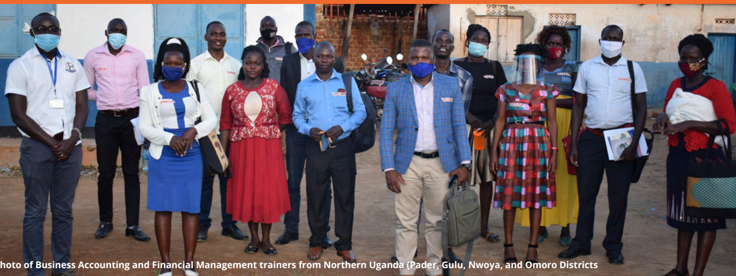
Group photo of Business Accounting and Financial Management trainers from Northern Uganda (Pader, Gulu, Nwoya, and Omoro Districts)